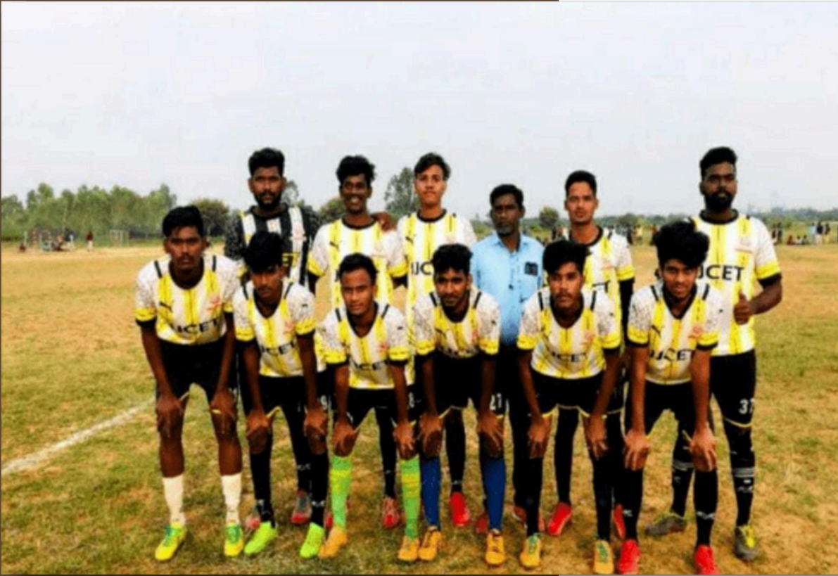
Anna University Zone 13 Football (Men) "RUNNER UP"